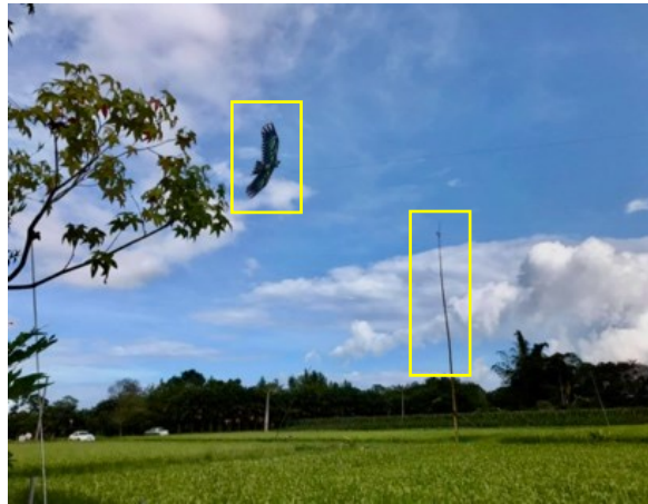
Figure 2. The Giant Bird Kite and Eagle Bamboo Pole

place for the kites to move when pushed by the wind movement. This design is a simulation of the presence of large birds upcoming and circling paddy fields that can become enemies for birds to prevent them from coming. They also implemented other creative solutions, it as bamboo high poles for eagle place in the middle of their rice fields (Figure 1b).