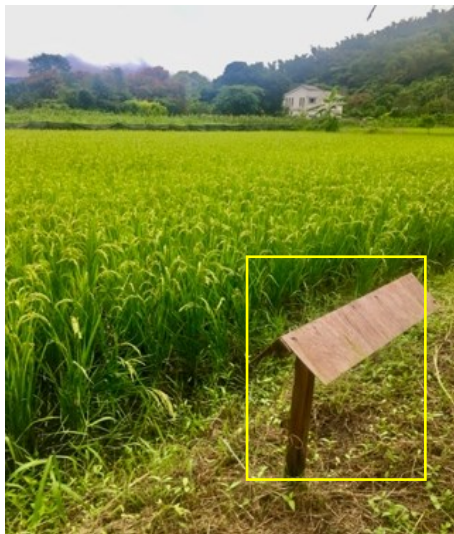
Figure 3. Firecracker

Alinggo also explained that they not only used the eagle stand and bird kites faced the little bird. They also used the mechanic method for pest management, which is the use of firecrackers (figure 2).