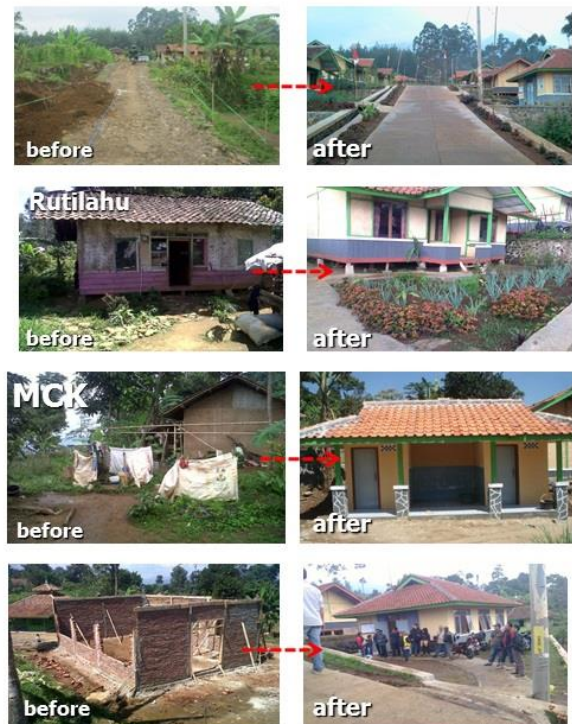
Figure 2. Improving the quality of housing and settlements in Pasirmulya Village, Bandung Regency