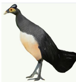
Figure 1. A Maleo bird ( Macrocephalon maleo )

where, A is the asymptotic (final) weight (g); B is the scaling parameters (constant of integration); k is the maturing rate (g/month); e is the natural constant (2.72); t is the time (month).