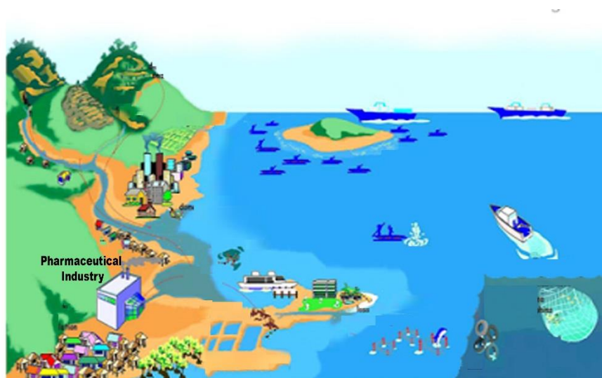
Figure 1. Industrial Development Locations of Intelligente Salzfabrik

The energy source system also comes from wave power around the sea; it is also expected to be a pilot plant that carries the concept of green-factory. The working system of a sea wave power plant will be made with a concrete tube installed at a certain height on the beach and its ends are installed below sea level. When there are waves coming to the shore, the water in the concrete tube pushes the air in the tube located on land (Wijaya, 2010). The opposite movement occurs when the waves subside. This alternating air movement is used to rotate the turbine connected to a power plant. There is a special tool installed on the turbine so that the turbine rotates in only one direction.